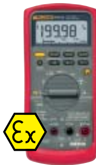
Fluke 87V Ex