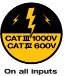
On all inputs