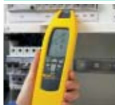
Location of fuses/breakers and assignment to circuits