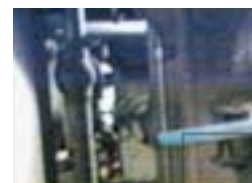
Full Visible Light