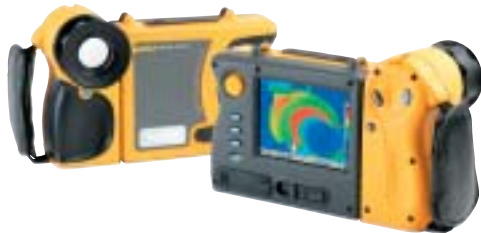
Fluke Ti40, Ti45, Ti50, Ti55