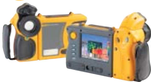
Fluke Ti40FT, Ti45FT, Ti50FT, Ti55FT